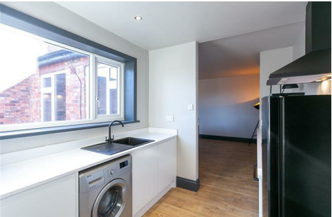
GROUND FLOOR 63 sq.ft. (5.9 sq.m.) approx.